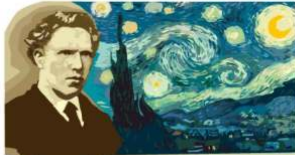
Vincent van Gogh

Youth of the Year—BGCA premier youth recognition program which promotes and celebrated Club members' service to the Club, community/family, academic performance, moral character, life goals, poise, and public speaking ability. Local winners advance to the state, regional, and then national competitions.